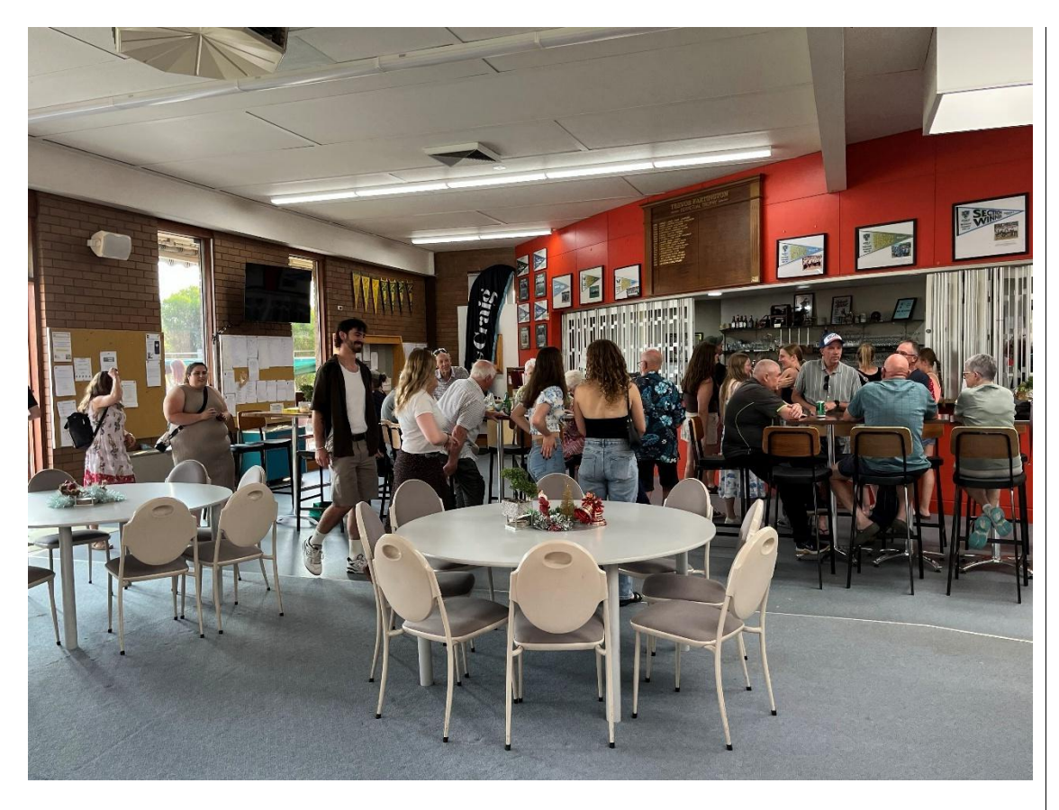
Friday Social / Members Draw Winners